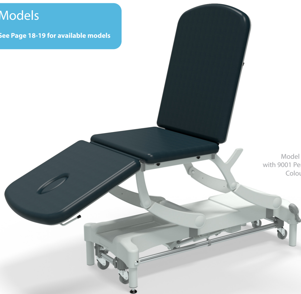
Model NV3567-PRM with 9001 Perimeter Foot Switch Colour Dark Blue