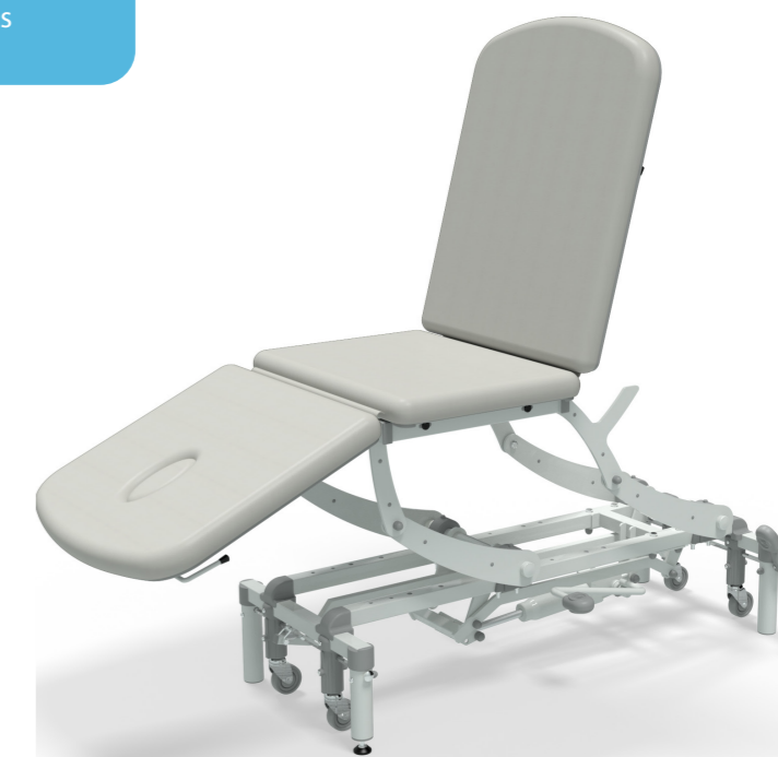
Model NV3557-CLS Colour White