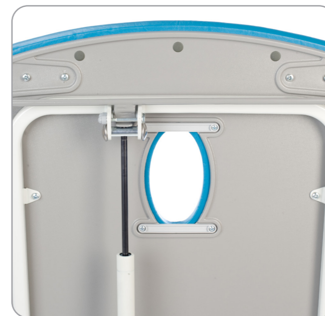
Offset gas strut for unobstructed patient view through breathing hole