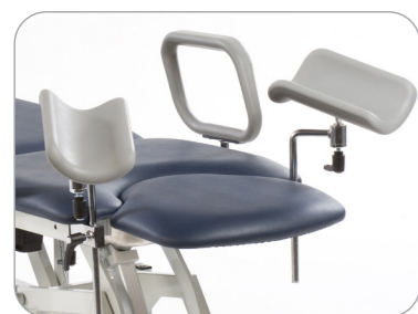
6043 Removable Leg Extension