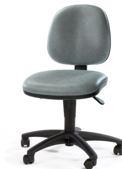
ST6100 Operators Chair