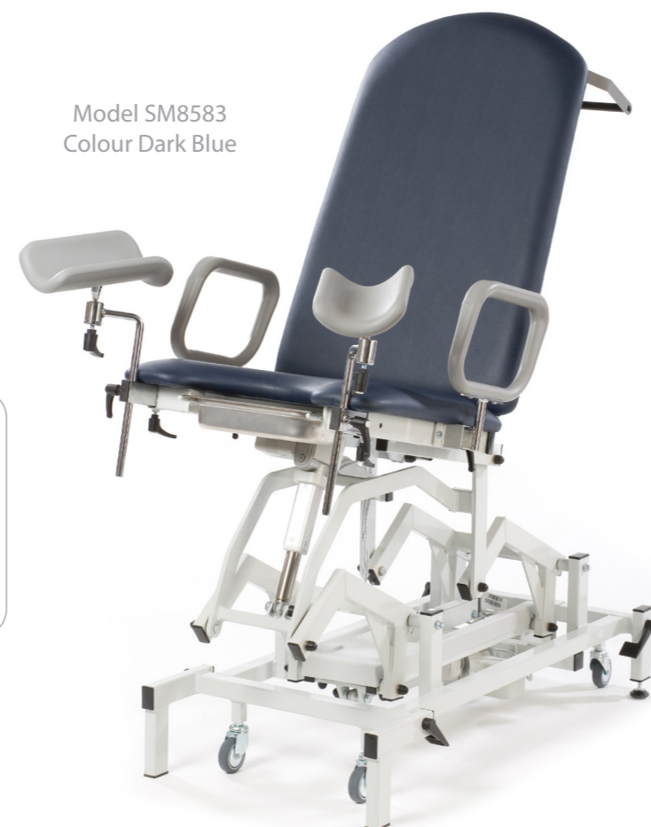
Model SM8583 Colour Dark Blue