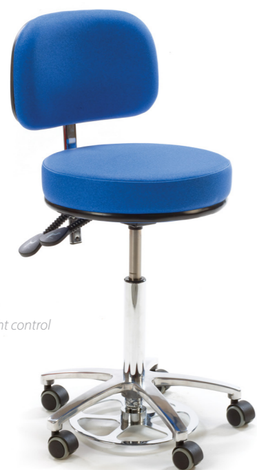
Model MC6179 Shown with optional foot height control