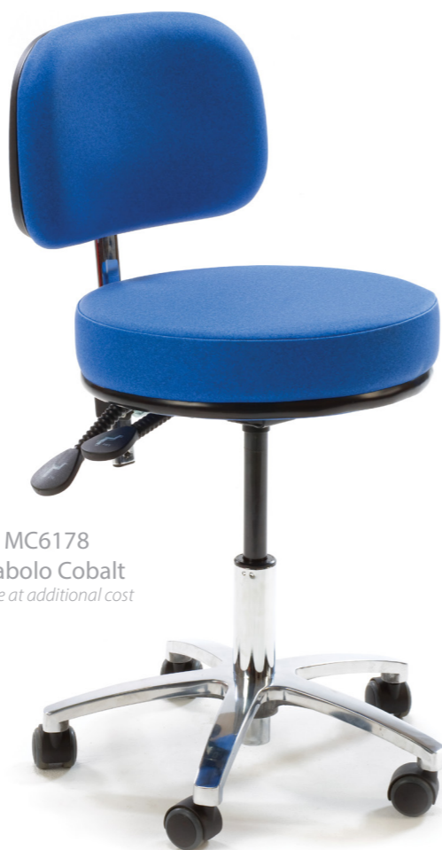
Model MC6178 Colour Diabolo Cobalt Colour available at additional cost