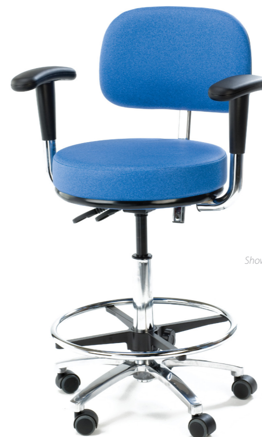
Model MC6179 Shown with optional height adjustable armrests Colour Diabolo Cobalt