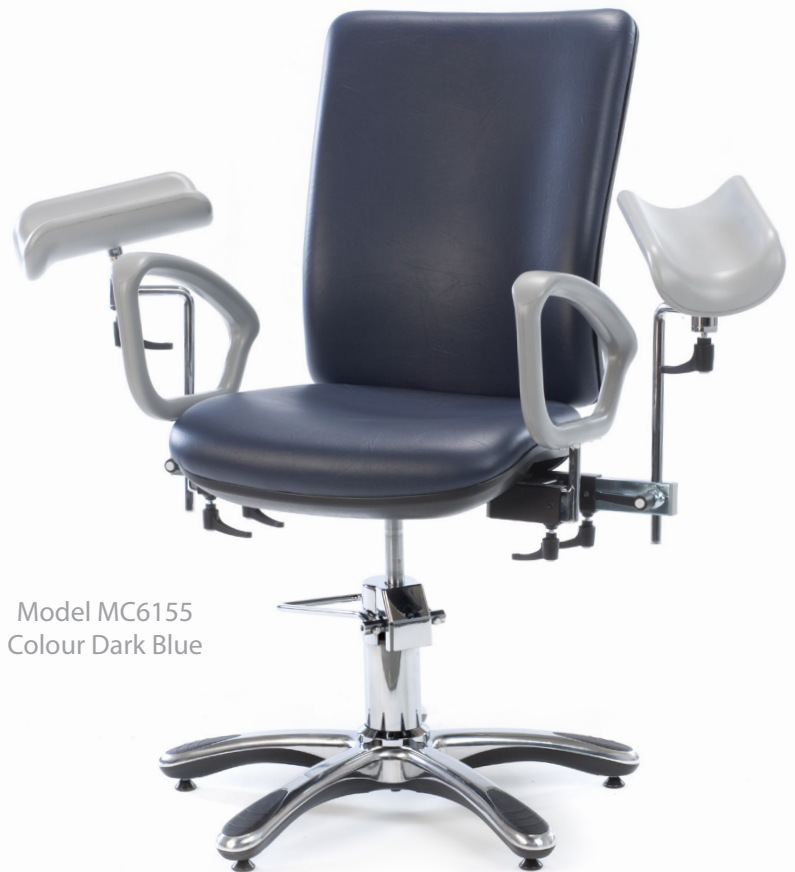
Model MC6155 Colour Dark Blue