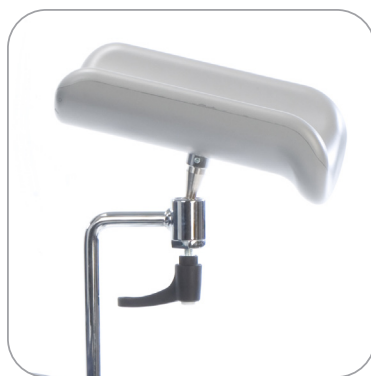
Fully adjustable moulded arm supports