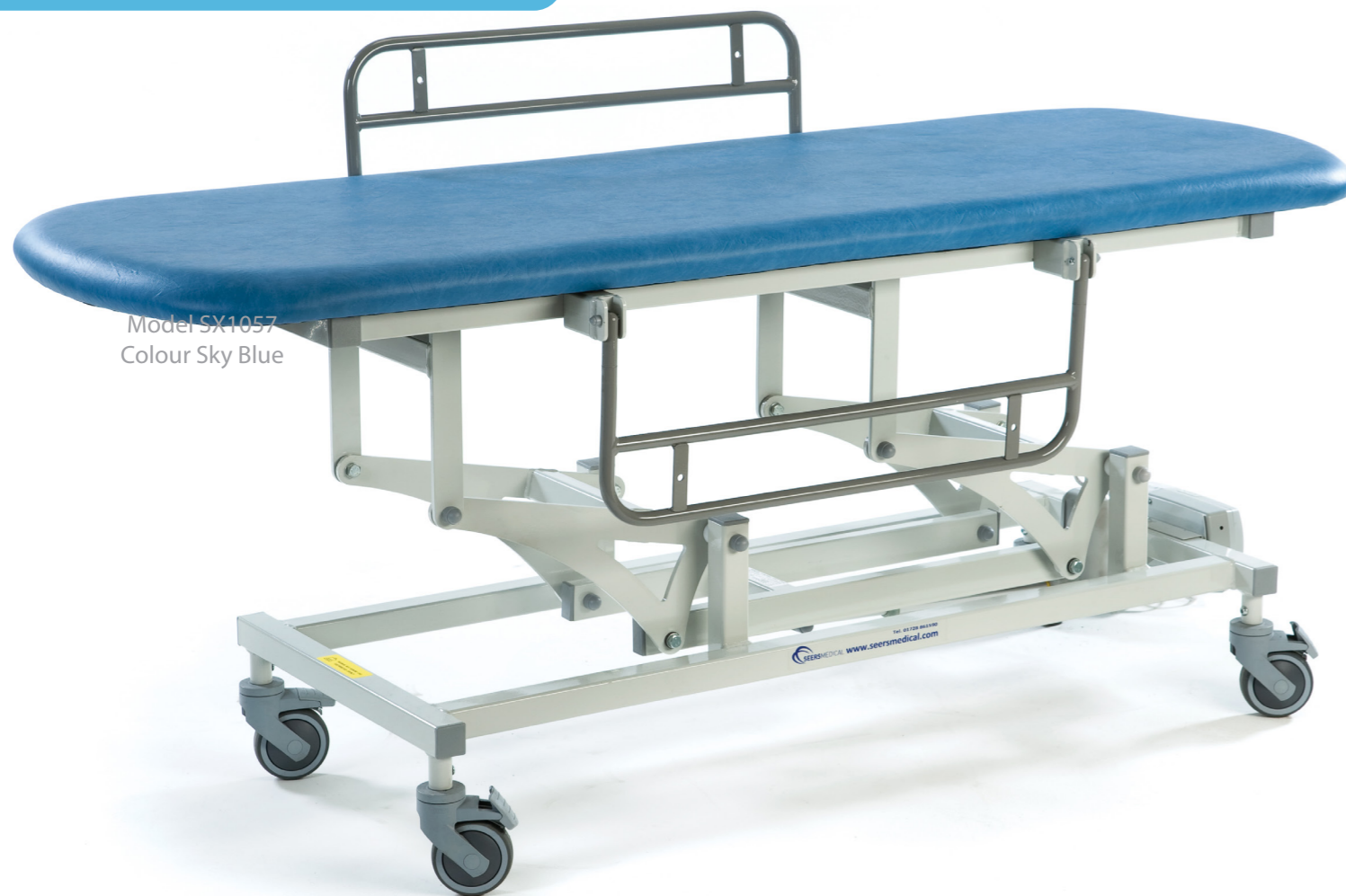
Model SX1057 Colour Sky Blue