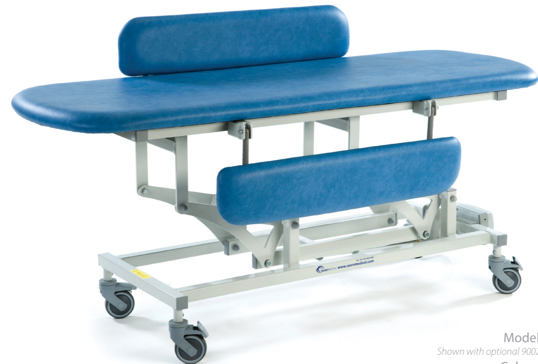
Model SX1047 Shown with optional 9002P Side Support Rail Cushions Colour Sky Blue