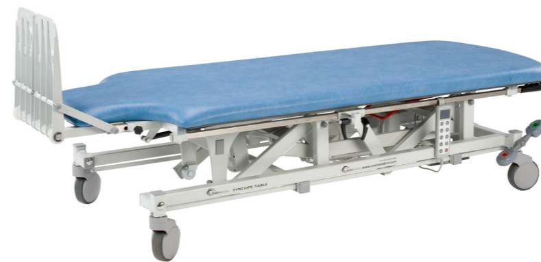
Lowers to 49cm for ideal transfer height