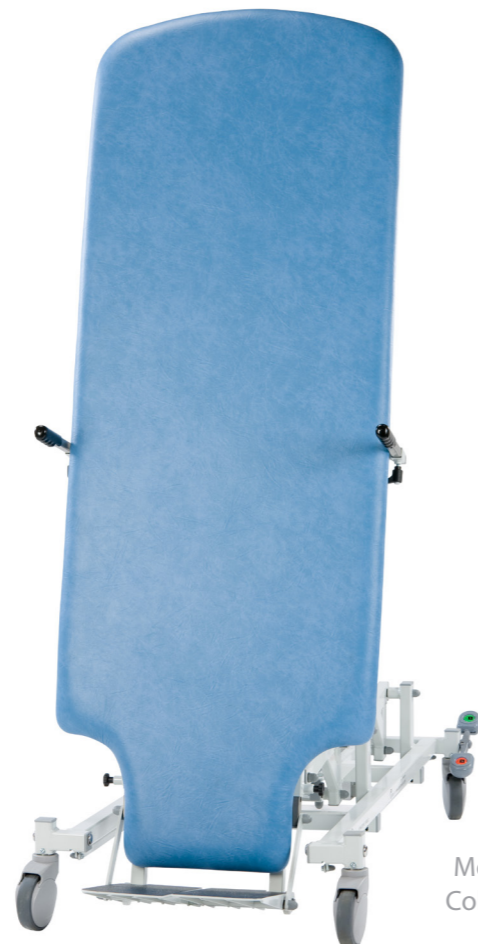
Model ST7645 Colour Sky Blue