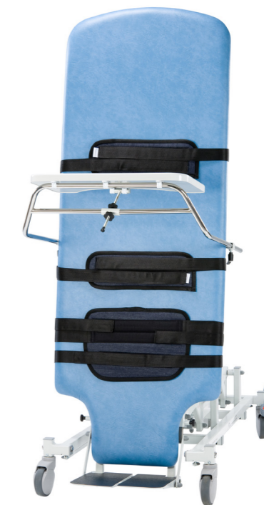
Set of harnesses & worktable included as standard